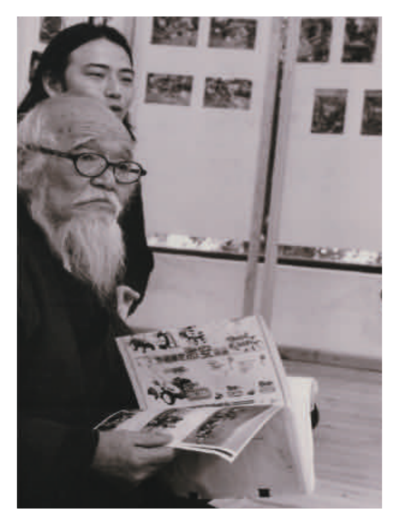
Masanobu Fukuoka, maestro dell'agricoltura naturale, in visita all'ashram di Cisternino, marzo 1999